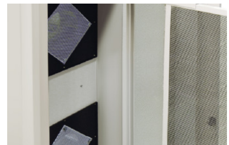
Sliding Bug Trapping Net