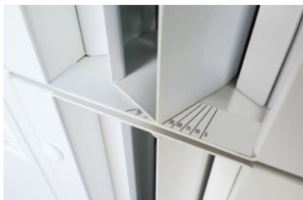
High Speed Nozzle (Movable)