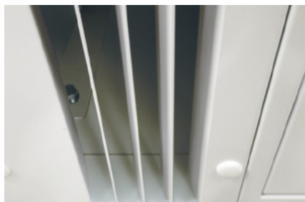
Low Speed Nozzle (Fixed)