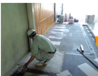
Marking the location