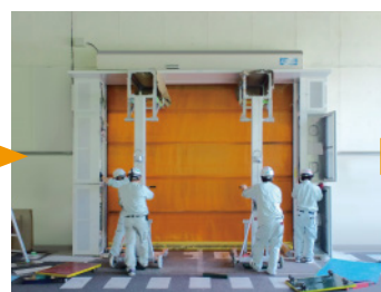
Installation/connecting the power cables