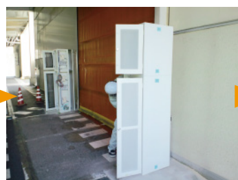
Setting up the units