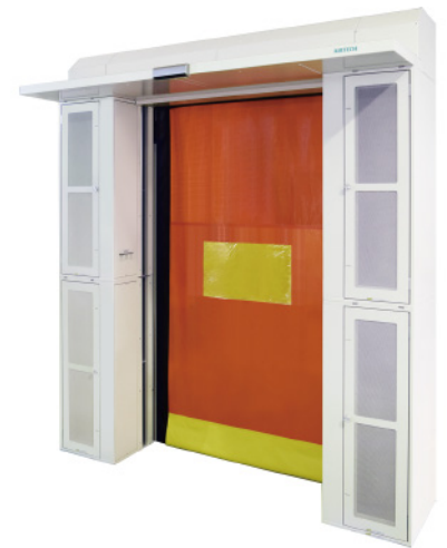
Built-in Fast Shutter Door Air Curtain for Bug-proof